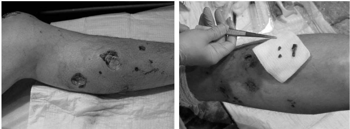
Fig. 2. Damage of the lower extremities caused by additional striking elements and debris from the body of stun grenade.