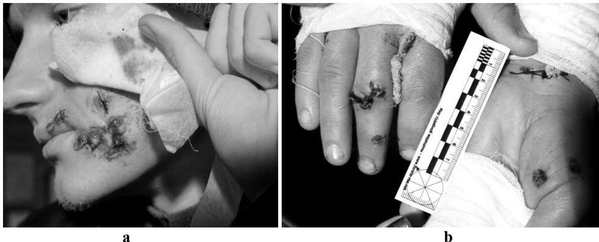
Fig. 1. Damage of head (a) and hands (b) caused by additional striking elements and debris from the body of stun grenade.

The greatest amount of damage was caused by an explosive injury. Numerous wounds of the head, upper extremities were caused by stun grenade, but the greatest number of them appeared at the lower extremities due to the formation of fragments from the shell of the grenades and additional striking components (nails, nuts, stones, etc.) that were added by "law enforcement officers" (Fig. 1-2). In addition, grenade breaks also led to thermal, chemical burns, contusions, loss of vision and hearing, which, in general, harmed the health of the largest number of people – 133. A significant number of victims – 55 received gunshot wounds from elastic bullets and buckshot by tools of shock-traumatic ("non-lethal") action in different parts of the body and extremities (Fig. 3), as well as lead meal and buckshot of firearms (Fig. 4 a).