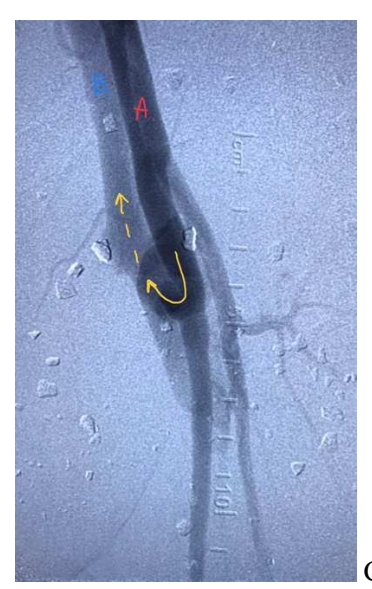
Fig.1. Mine explosion injury in a serviceman with CGWMVLE, where: a – X-ray imaging of fragments, b – functioning post-traumatic arteriovenous fistula between the common femoral artery and vein (MSCT with contrast), c – stent-graft stenting operation of AB-fistula.

The endpoints of the diagnostic algorithm were: determination of limb viability, stage of acute or chronic ischemia, degree, form and nature of venous insufficiency, especially development of postthrombotic disease, severity of concomitant and combined injuries, infectious complications and others. As a result, in each case, a unique algorithm of surgical tactics was developed, which ultimately permitted to develop appropriate standards for individual groups in CGWMVLE.