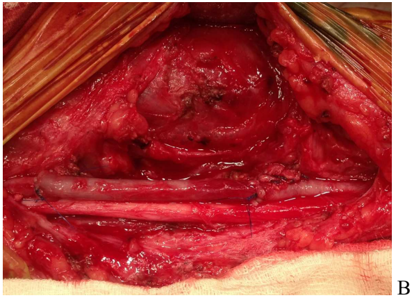
Fig. 3. False aneurysm of the brachial artery, where: a - aneurysmectomy procedure, b - autovenous prosthesis of the brachial artery.

The usefulness of a temporary shunt was very high. An alternative access to provide proximal vascular control was access to retroperitoneal iliac vessels according to Pirogov. Synthetic vascular prostheses were used in case of too large diameter of the femoral artery or lack of time and autovein (fig. 4).