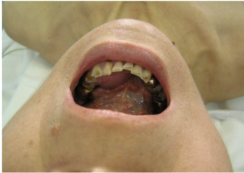
Fig. 1. The external view of the "brown tumor" in the mandible from the side of oral mucosa.

bones at the site of pronounced fibroosteoclasia, also leads to compression of adjacent organs. In the studied patients, these formations were most often found in the mandible (fig. 1). When localized in the extremity area, such metastatic calcifications can cause significant impairment of motor function and joint mobility due to gross deformity of the extremity's anatomy (fig. 2).