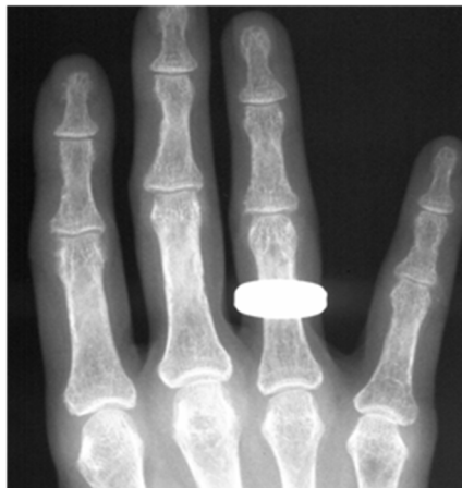
Fig. 3. Subperiosteal resorption of the hand phalanges in SHPT.

Methods of instrumental diagnostics were used to both confirm the presence of SHPT and assess its severity and visualize the parathyroid glands properly.